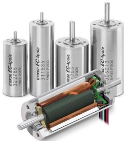
Figure 4: The maxon EC-4pole product family.